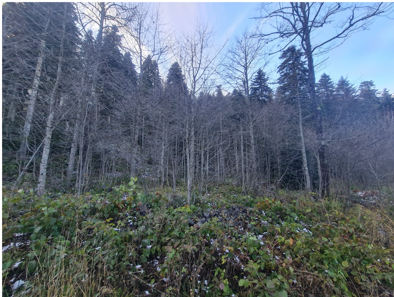
Figure 1. Habitat type from which Apodemus sp. samples were collected from Seyitler Campus of Artvin Çoruh University

A total of 116 larvae were extracted from the ears of five R. rattus specimens, three larvae were extracted from the ears of one Apodemus sp. Larvae-bearing ears of captured host specimens were placed in separate Eppendorf tubes. Then mites were detached using an entomological pin and preserved in 75% ethanol, cleared in Nesbitt's solution and mounted on glass microscope slides using Hoyer medium. Measurements (given in micrometers) were made and photos were taken using a Bx63 phase contrast Olympus microscope. The terminology follows Goff et al. (1982), Kudryashova (1998), and Stekolnikov & Daniel (2012). The specimens are deposited in the Acarology Laboratory of Erzincan Binali Yıldırım University, Erzincan, Türkiye (EBYU).