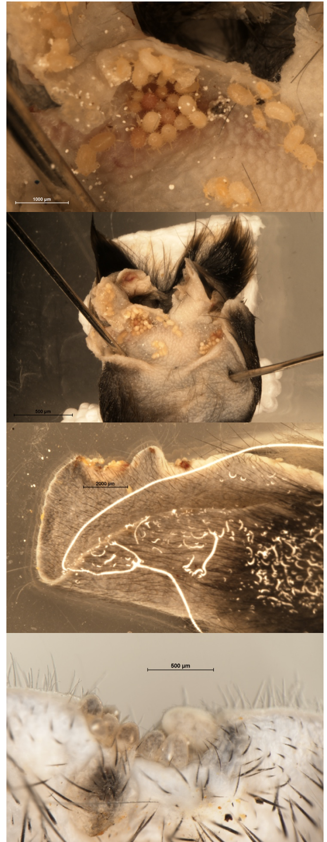
Figure 4. Larvae that infest the inner and surrounding areas of the ears of different hosts.

In this study, S. thracica collected from R. rattus for the first time. This represents the first host record for this species. The previously recorded hosts of these larvae are given in Table 2.