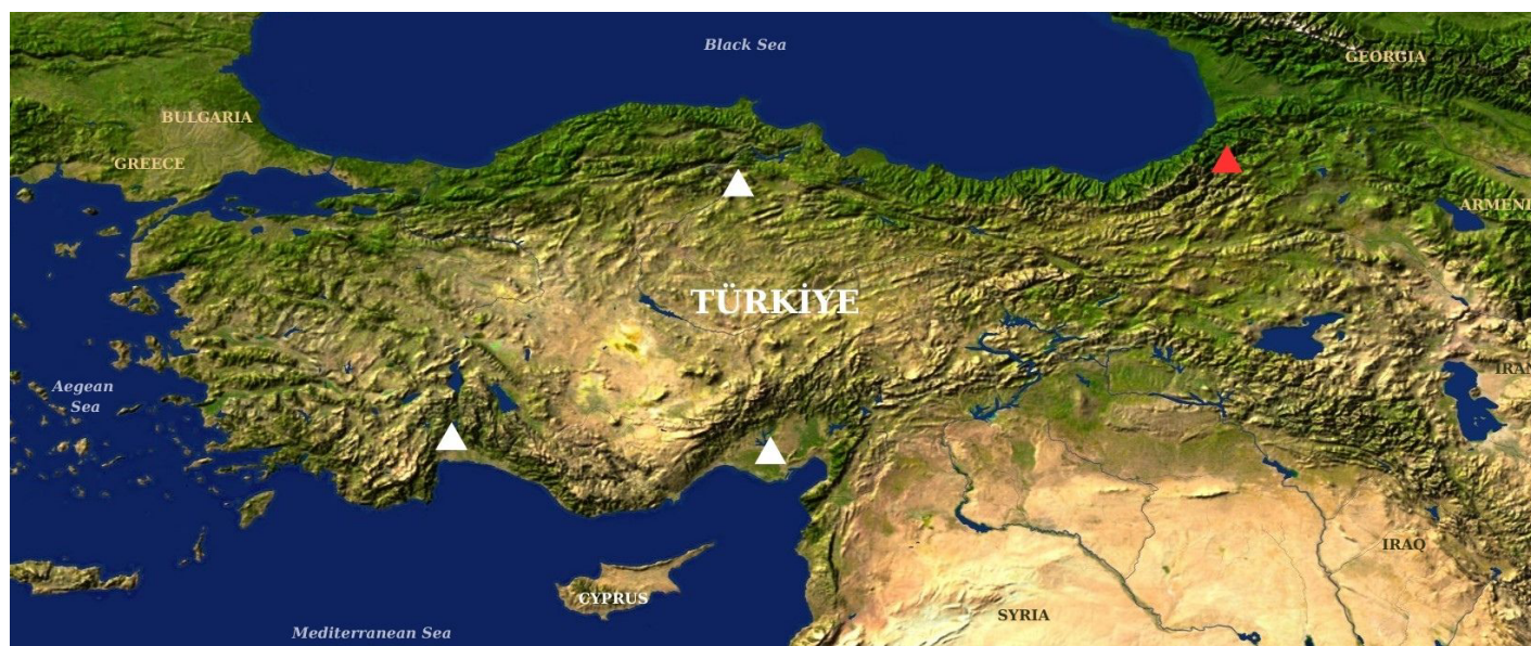
Figure 3. Map of collection sites of Schoutedenichia thracica in Türkiye (Red triangles indicate specimens collected in this study, whereas white triangles represent specimens from previous studies).